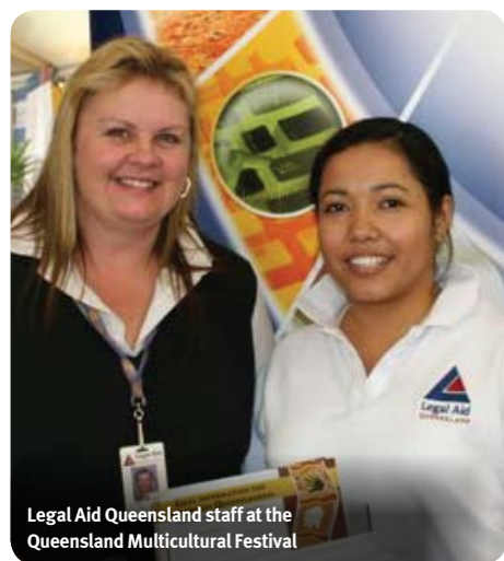
Legal Aid Queensland staff at the Queensland Multicultural Festival